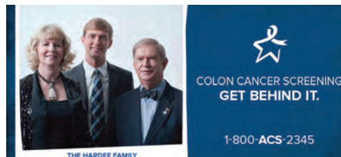
THE HARDEE FAMILY